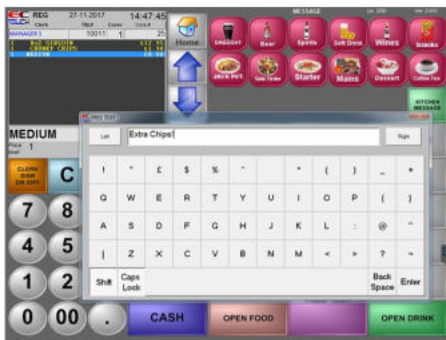
Message to the kitchen