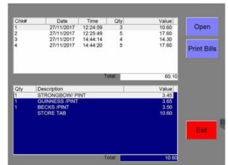
View Outstanding bar tab