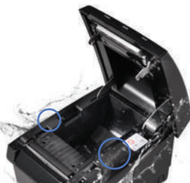
Dual layers for water protection