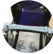
Adjustable Paper Shaft Design