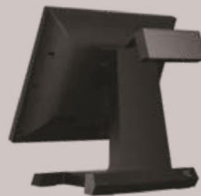
Customer Display (VFD)