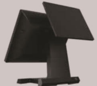
2nd Dispalry - 10", 15"